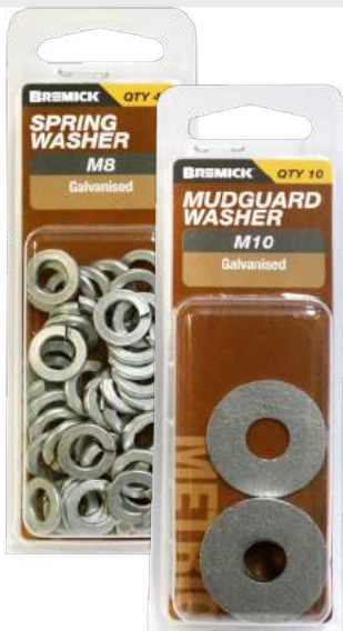
B8 & GAL SPRING WASHERS