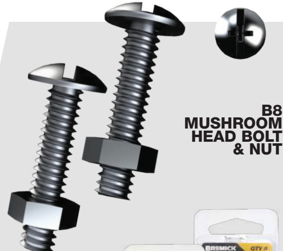
B8 MUSHROOM HEAD BOLT & NUT